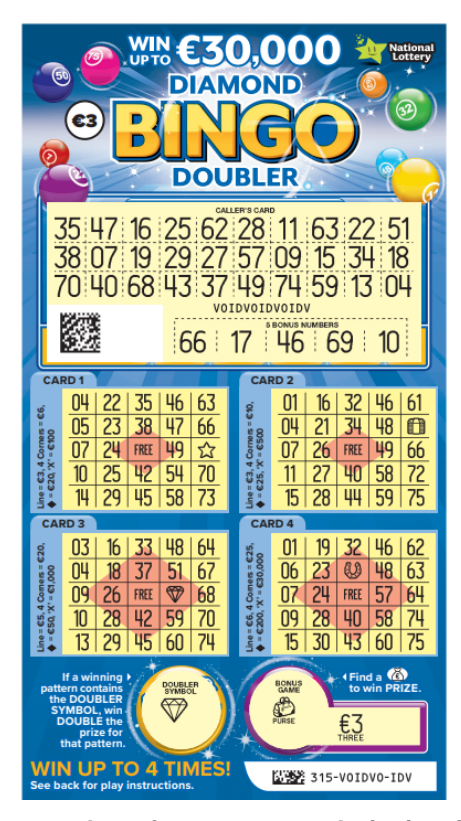
Please see above for an uncovered winning ticket