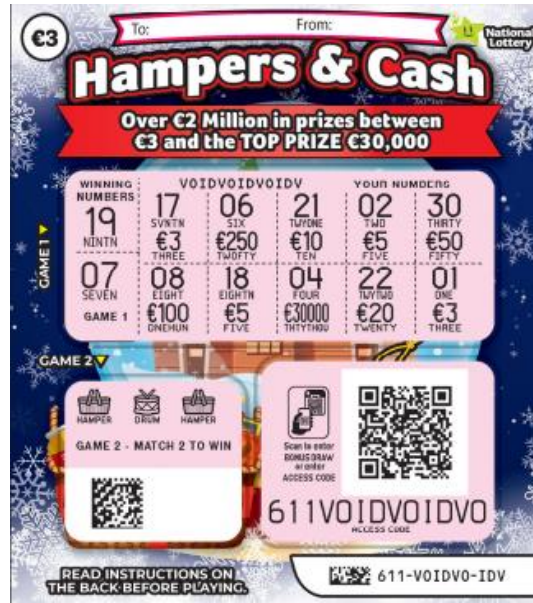
Please see above for an uncovered winning ticket