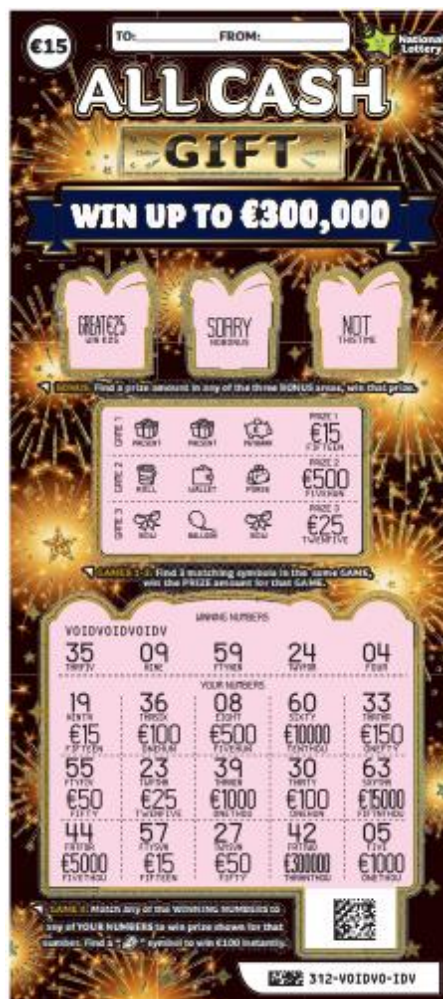
Please see above for an uncovered winning ticket